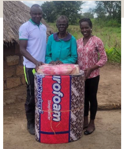
EFU team delivering a mattress

Through home visits and daily care, we supported older persons living alone or with limited family support, helping ease loneliness and neglect. Community health outreaches provided basic check-ups, health talks, and follow-up care. For many older persons, food support made daily meals possible, while essentials like mattresses and other beddings brought comfort, rest, and dignity to elders who had been sleeping on bare mud floors & worn-out mats.