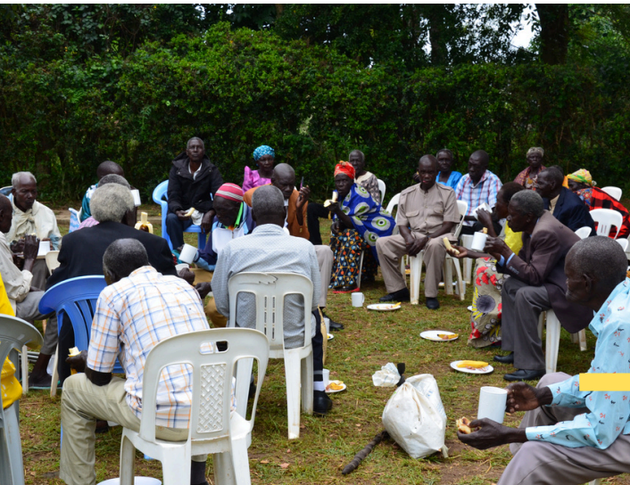
Elders having a snack during celebrations.