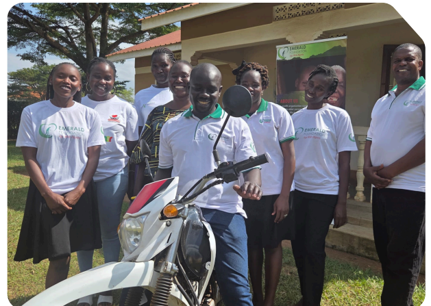
Program Team receiving the Motorbike in 2025