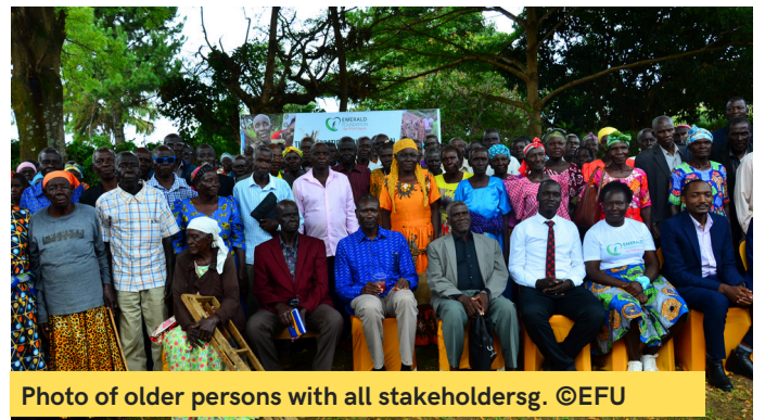
Photo of older persons with all stakeholders.