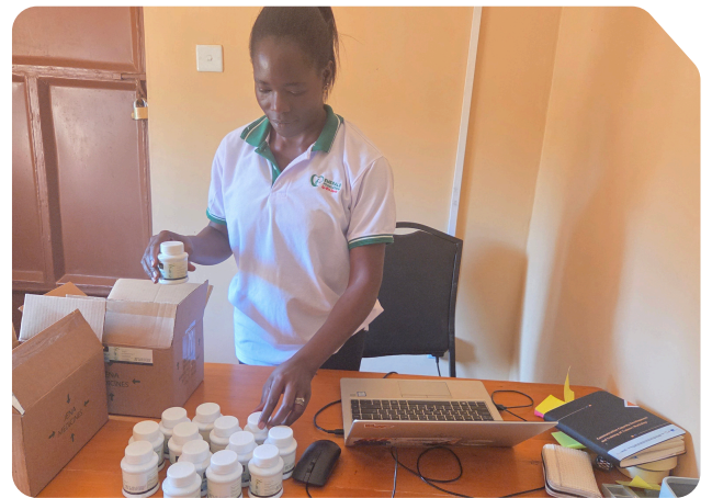
Sorting drugs for community distribution