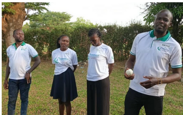
Participants during break off activity

Staff participated in hands-on exercises, field simulations, and mobile editing sessions, gaining confidence in storytelling that highlights both challenges & solutions. This has positioned EFU to engage media, partners, and the public more effectively, while strengthening advocacy for the rights and well-being of older persons.