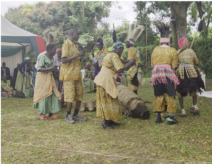
Elders performing a cultural song/dance.