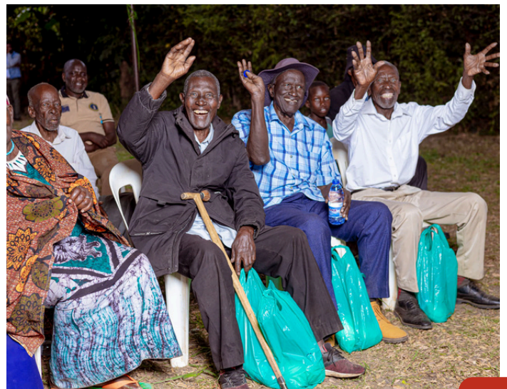
Celebrants reacting to a performance