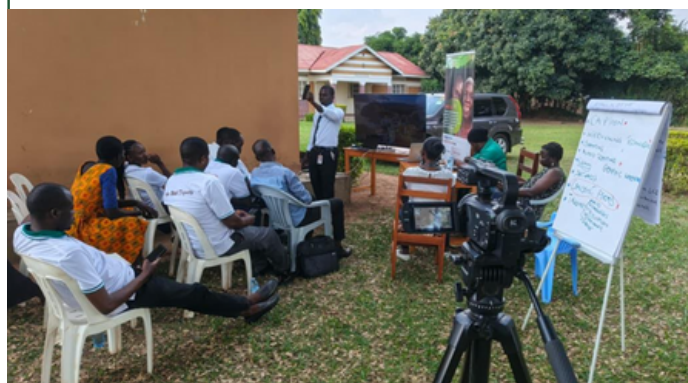
Session on short video editing using VN app