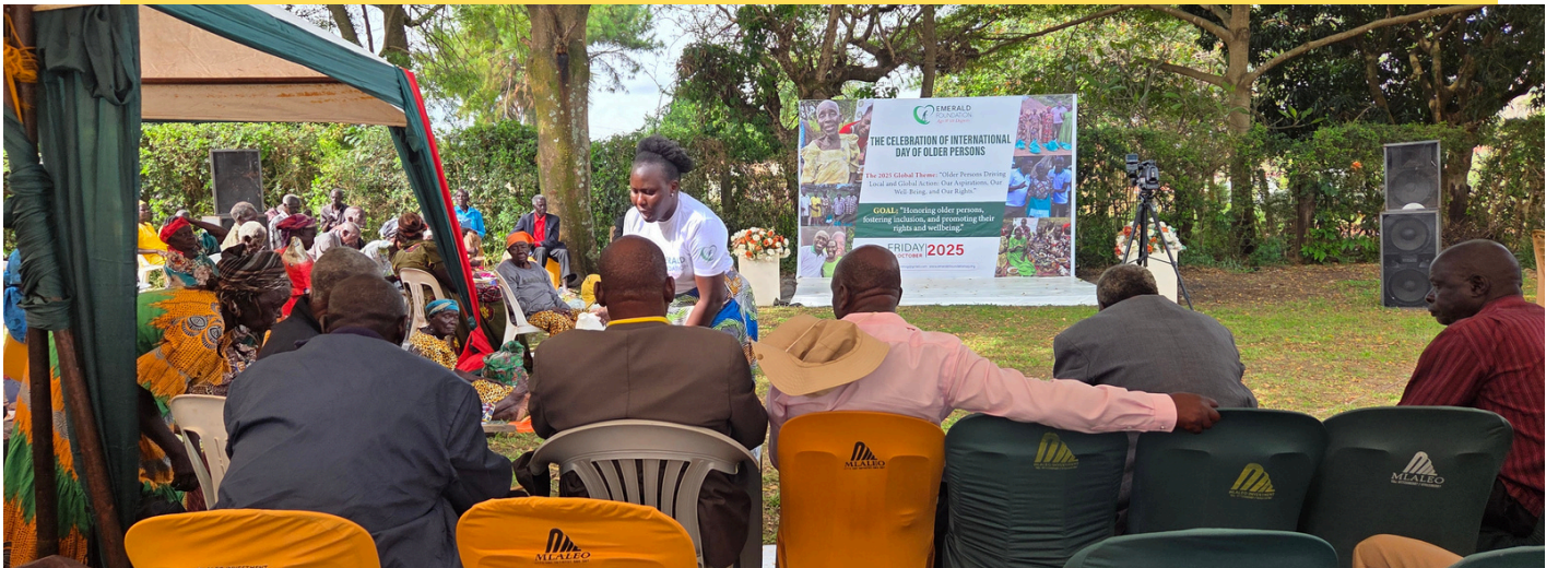
EFU Executive Director serving elders during the event.