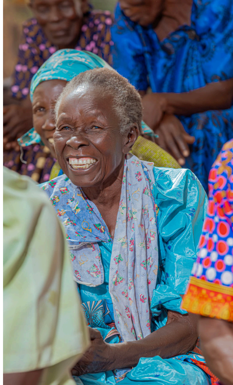
Older persons all smiles