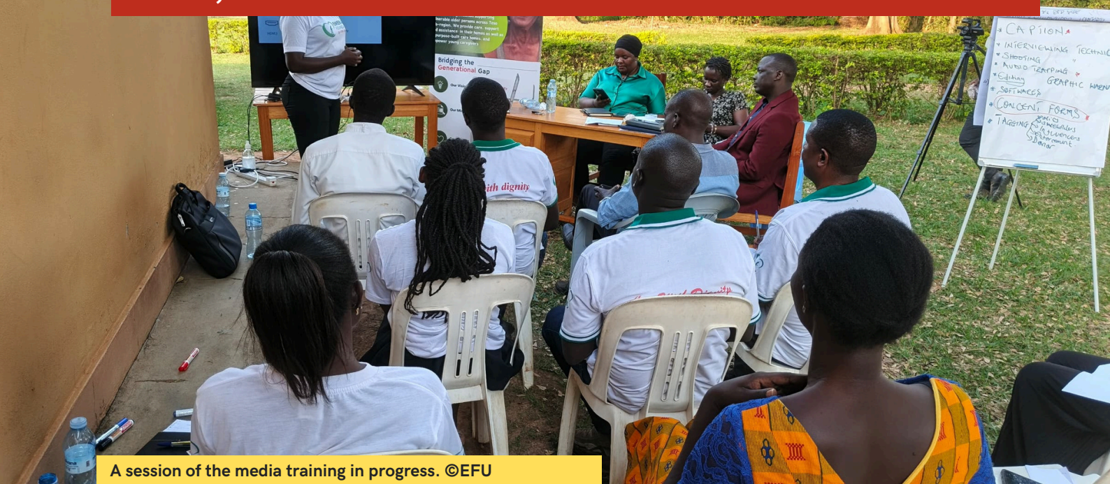
A session of the media training in progress.