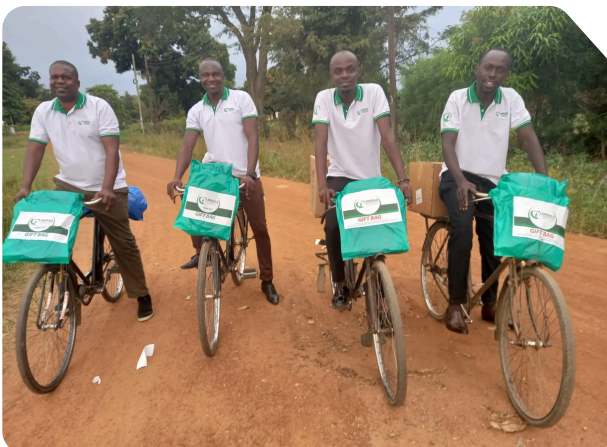
Our team riding to the community to deliver food in 2024

Of note this year, was the purchase of a motorbike, funded by the friends & partners of the Greg Gelburd Foundation. Until then, our team relied on bicycles to reach distant communities, limiting reach and straining staff. Today, our team is able to reach older persons more efficiently and consistently.