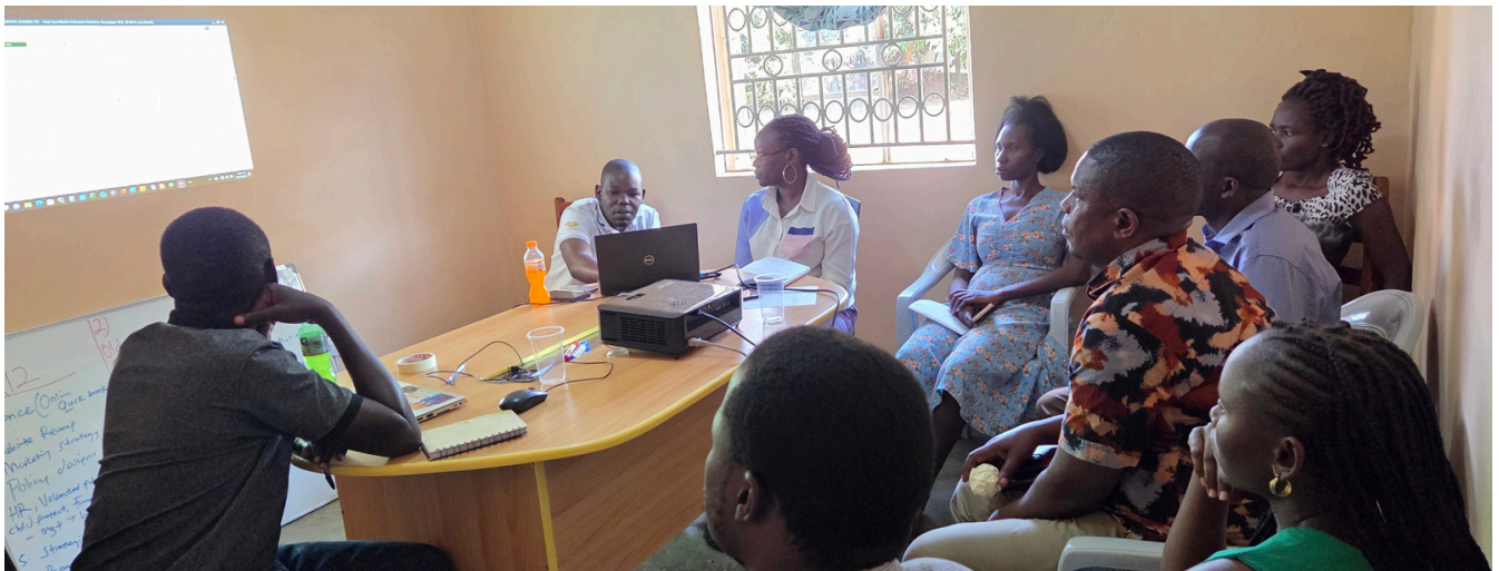
Participants in one capacity building workshop

In 2025, Emerald Foundation Uganda made deliberate investments in strengthening the systems, skills, and structures that enable our work to thrive sustainably. A major milestone was the GIZ-funded capacity-building project titled "Strengthening Emerald Foundation Uganda's Internal Capacity to Implement Impactful and Sustainable Programs." Through this project, we began enhancing our governance, management, financial, M&E, and human resource systems to ensure that EFU is better equipped to sustainably deliver accountable, high-impact programs for older persons.