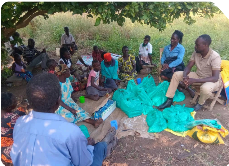
Amuria, Dokolo Beneficiaries receiving food packages