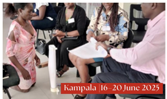
PM (kneeling) in an activity demonstration

In October 2025, our Programs Manager (PM) participated in a Monitoring and Evaluation (M&E) training supported by GIZ in Kampala, strengthening our ability to measure outcomes, learn from our work, and communicate impact more effectively to partners and donors.