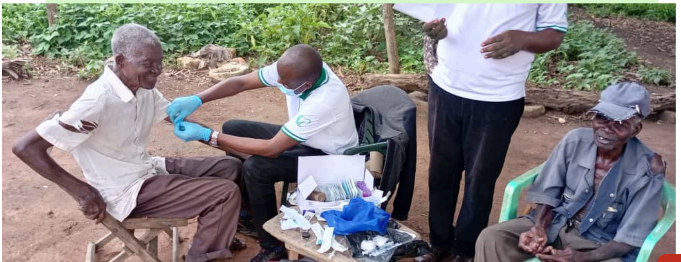
Rapid diagnostic testing during a health camp.

We also now plan to expand health camps throughout Teso so more elders can be tested, treated, and supported. This is an important shift toward listening to what data and people are telling us and acting early on health concerns that too often go unnoticed.