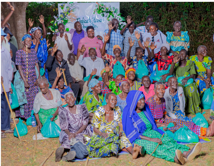
Older persons with their food packages

These moments of connection reminded us that healthy ageing goes beyond physical care. It also includes emotional wellbeing, social inclusion, and the simple power of being seen, heard, and valued within the community.